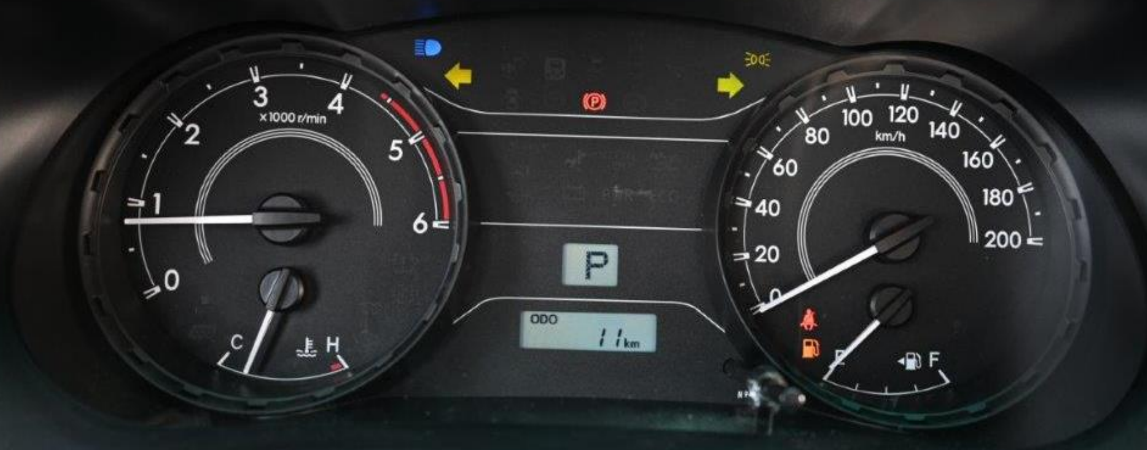
2024 TOYOTA HILUX DOUBLE CAB PICKUP 2.4L DIESEL 4WD AT