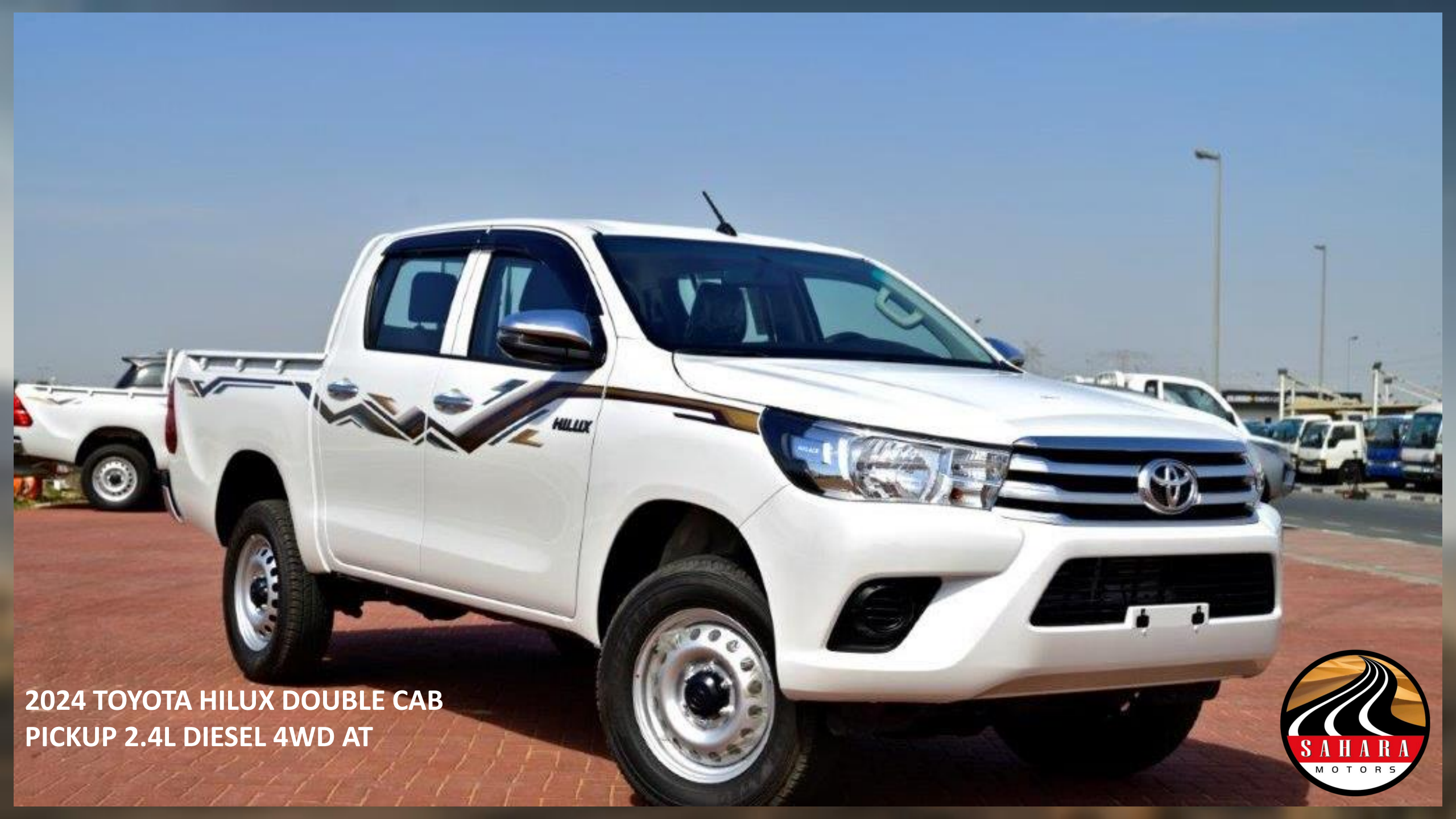
2024 TOYOTA HILUX DOUBLE CAB PICKUP 2.4L DIESEL 4WD AT