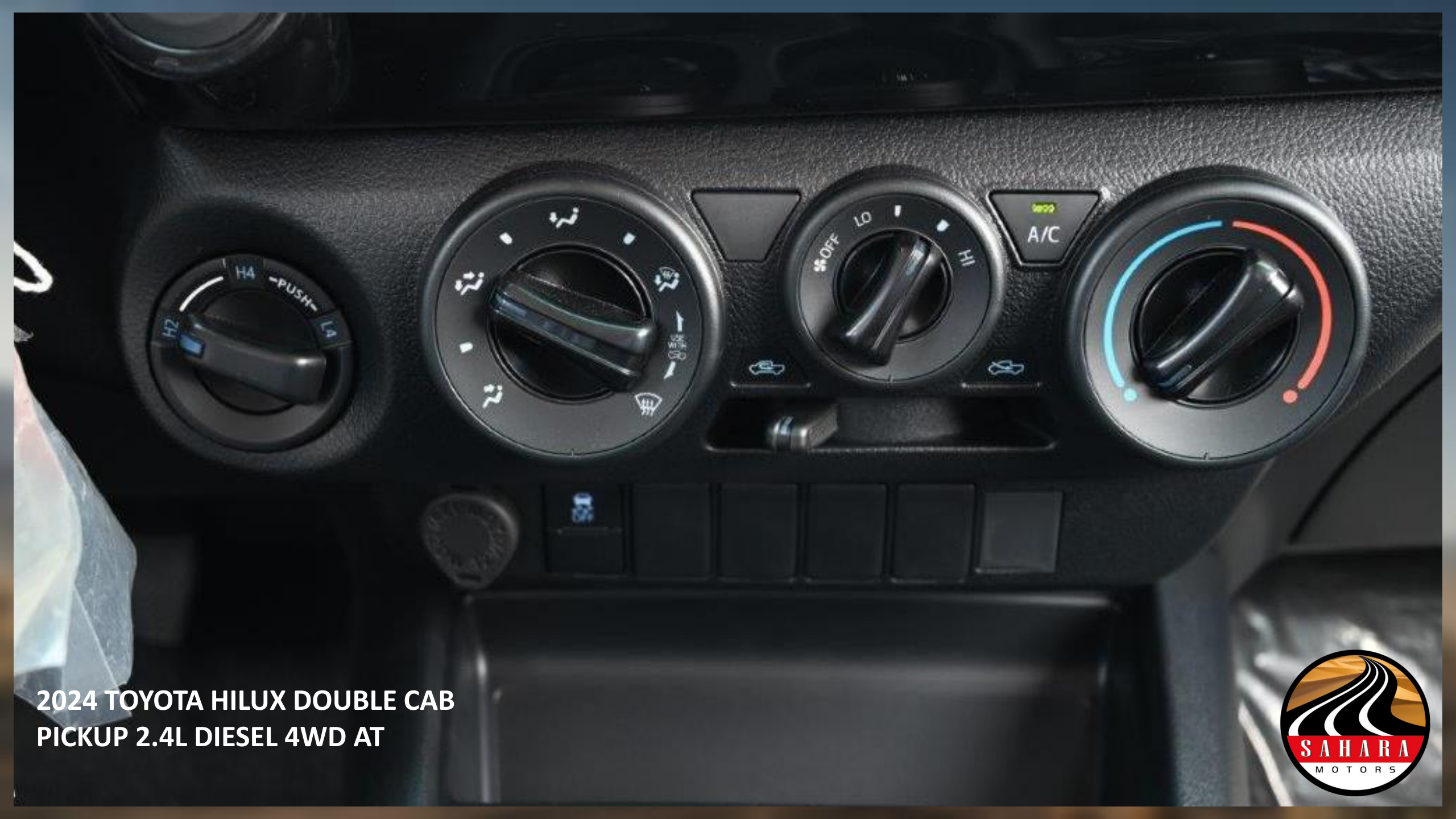
2024 TOYOTA HILUX DOUBLE CAB PICKUP 2.4L DIESEL 4WD AT