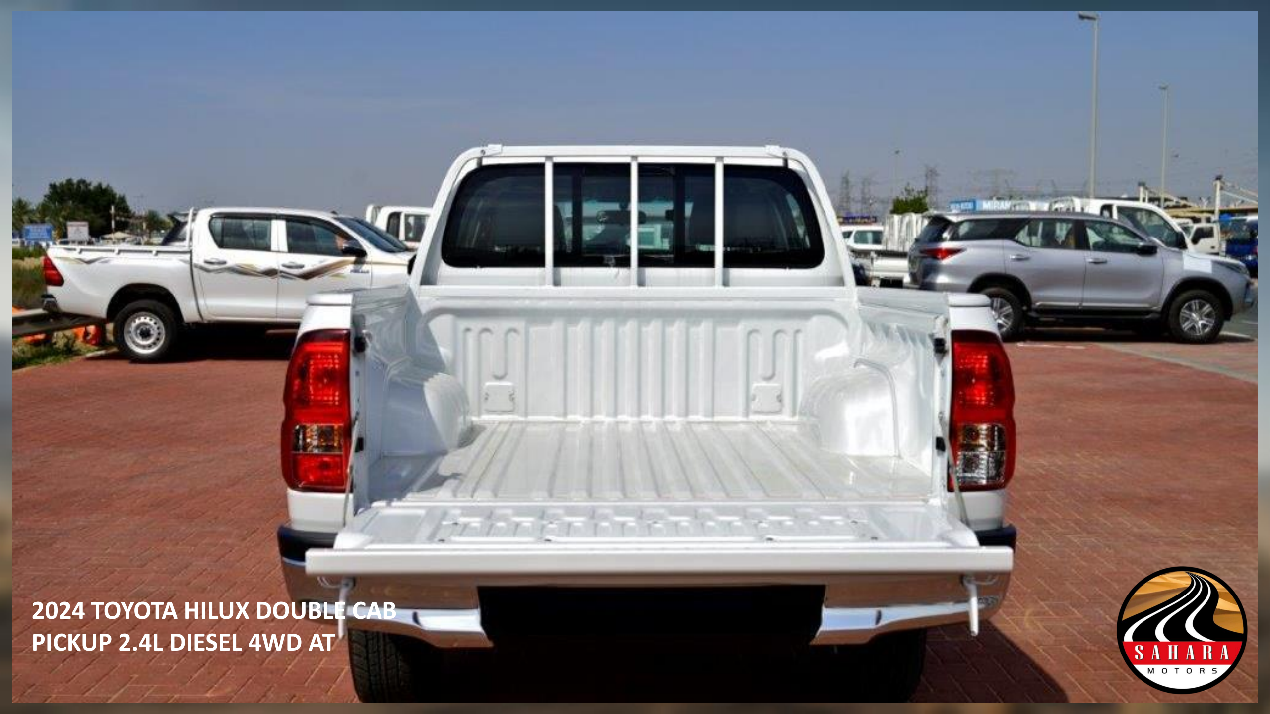
2024 TOYOTA HILUX DOUBLE CAB PICKUP 2.4L DIESEL 4WD AT