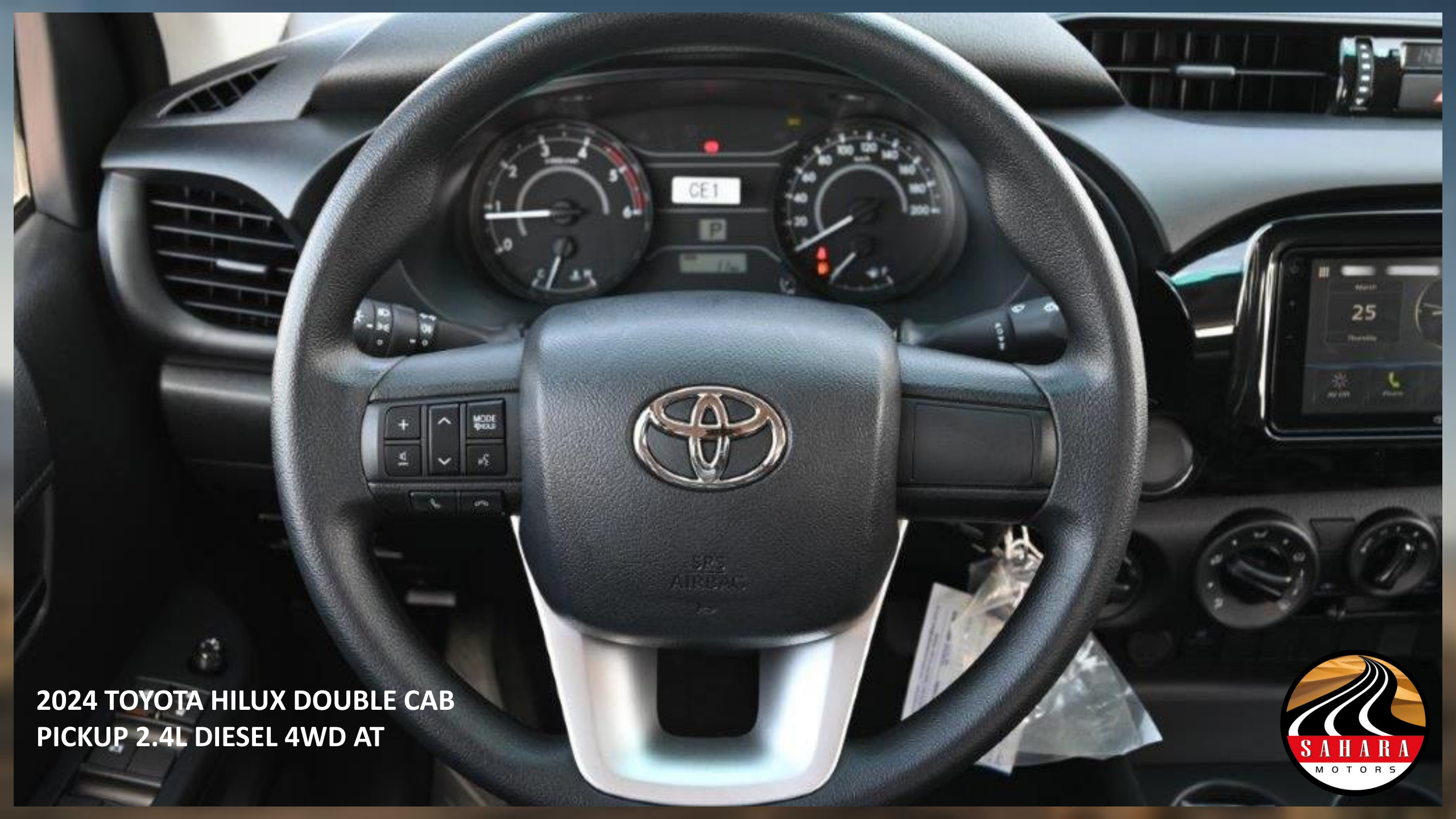
2024 TOYOTA HILUX DOUBLE CAB PICKUP 2.4L DIESEL 4WD AT