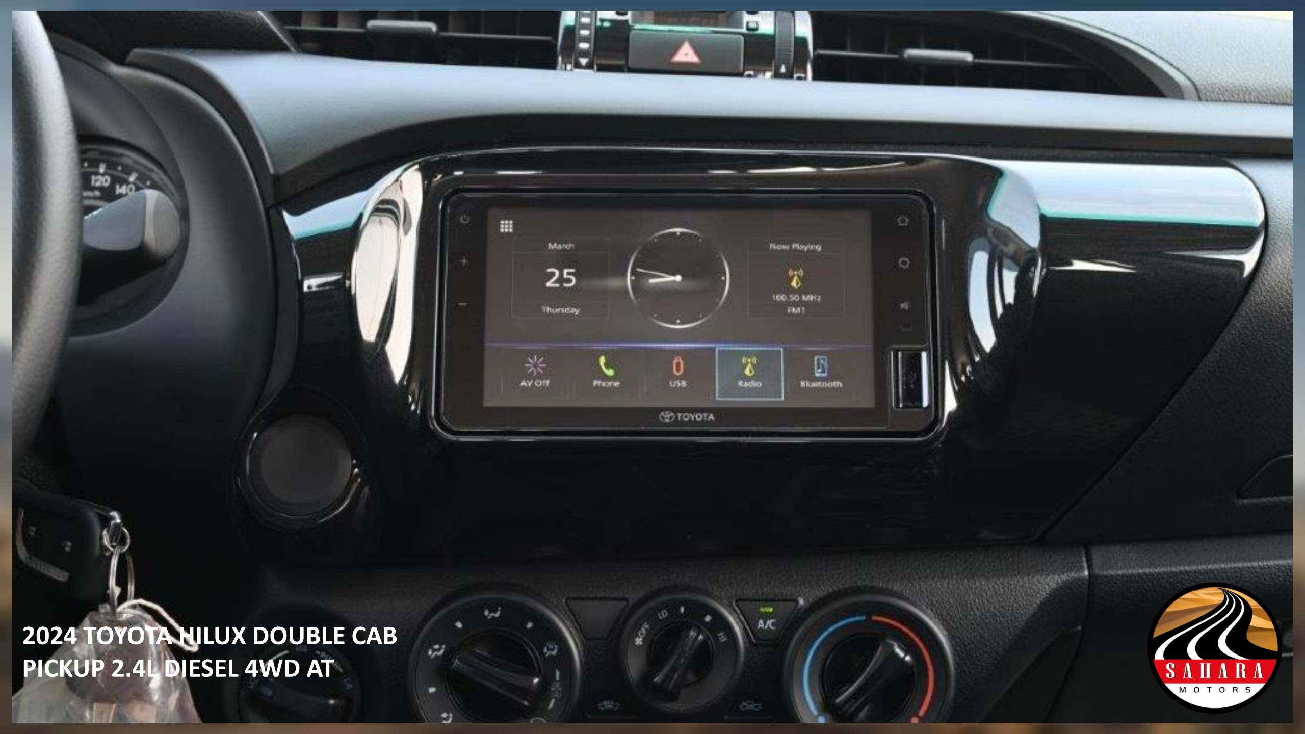
2024 TOYOTA HILUX DOUBLE CAB PICKUP 2.4L DIESEL 4WD AT