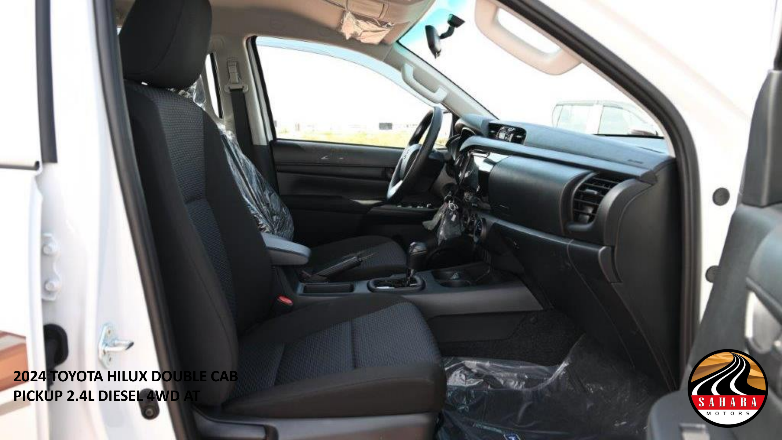
2024 TOYOTA HILUX DOUBLE CAB PICKUP 2.4L DIESEL 4WD AT