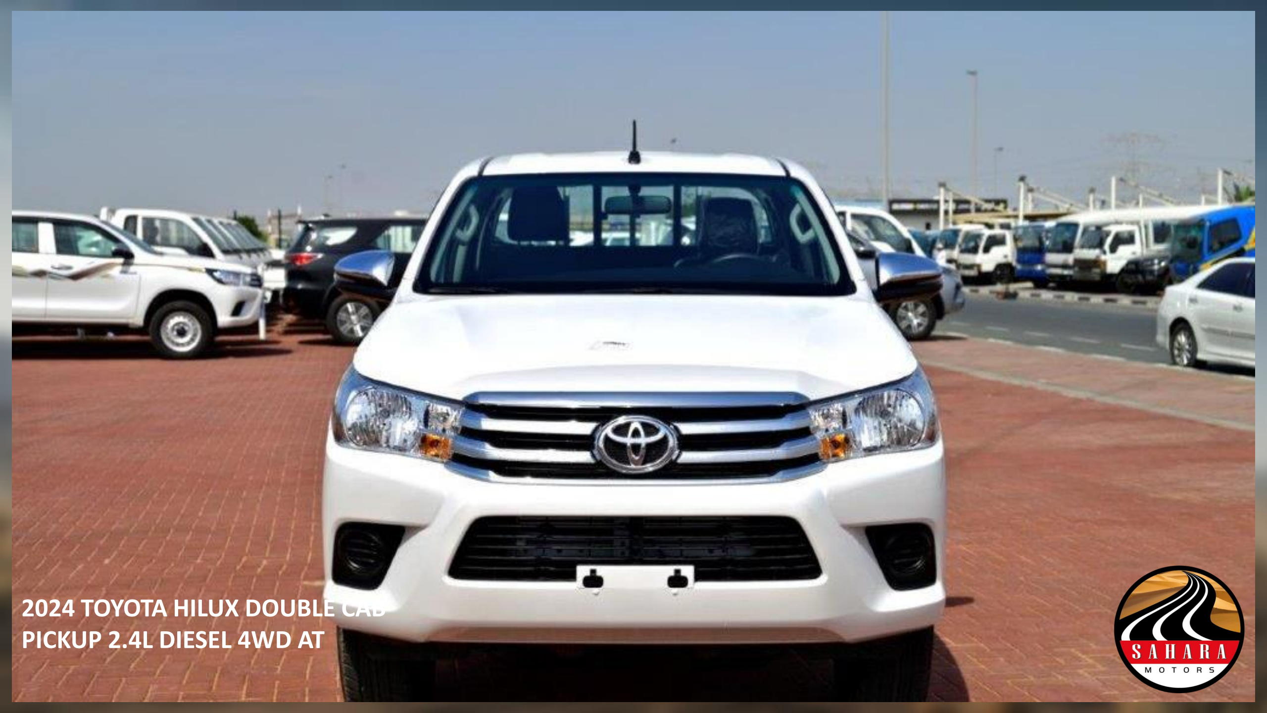
2024 TOYOTA HILUX DOUBLE CAB PICKUP 2.4L DIESEL 4WD AT